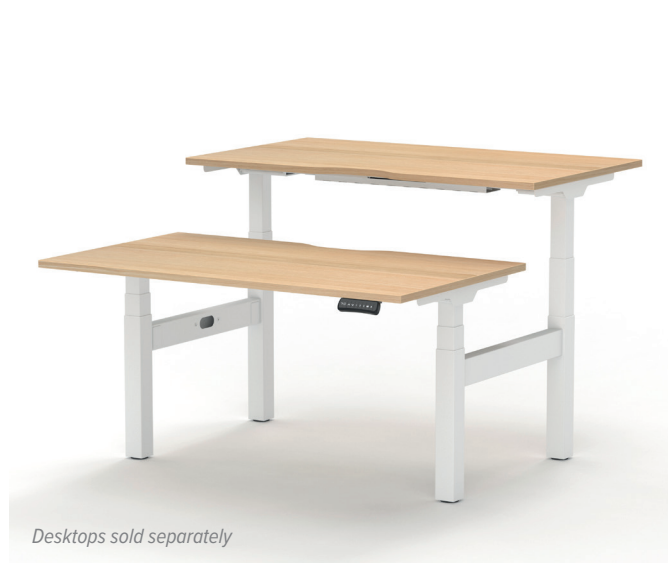
Desktops sold separately